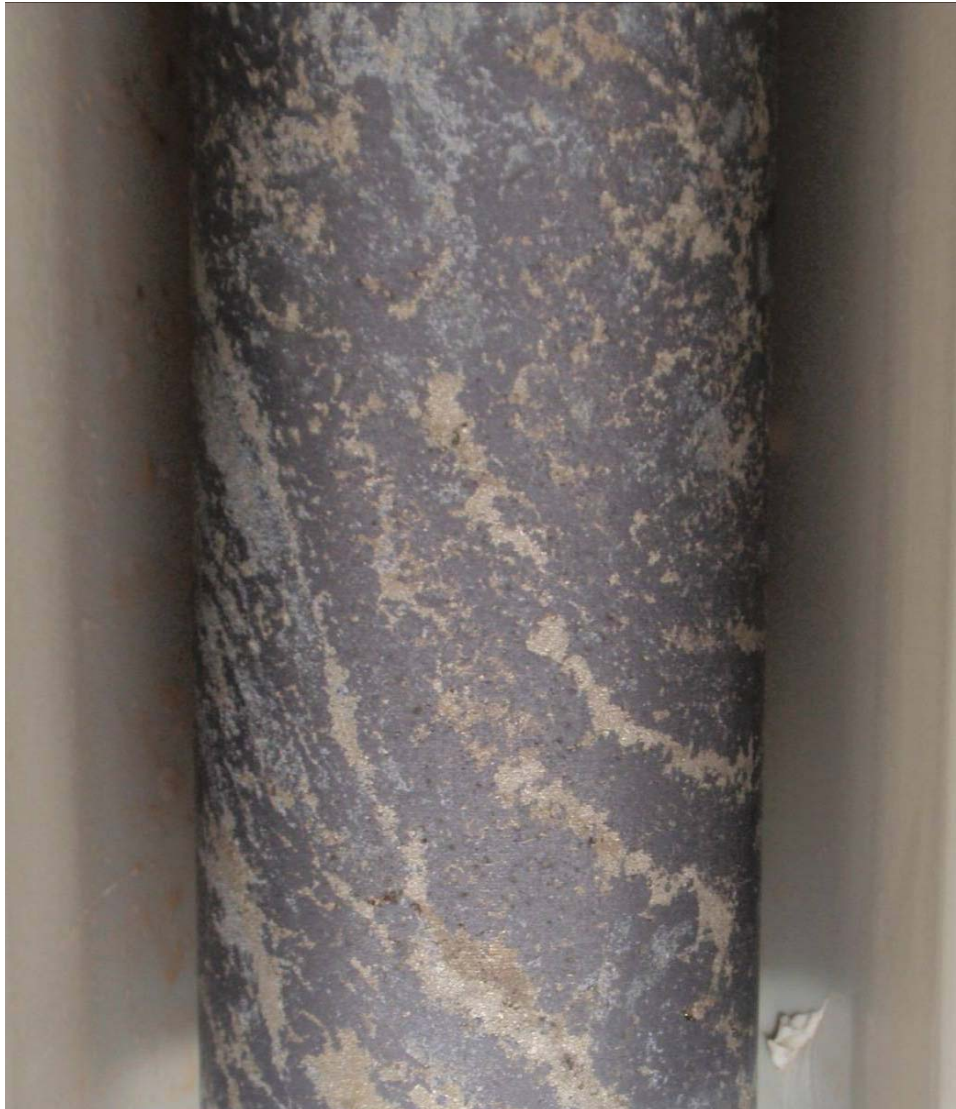
Figure 2: Pervasive magnetite-pyrite alteration in drill hole NEUDD-01.